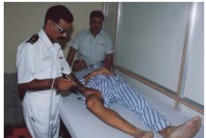
Fig. 2 : Technique of use : localisation of tender point (TP) and application of probe to it