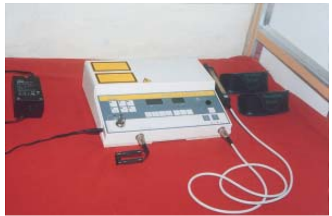
Fig. 1 : Endolaser 486 machine with probe

Stress fractures results from the application of abnormal muscle stress on a bone and is associated with new strenuous or repeated activity. Tibial stress fractures are often confused with medial tibial stress syndrome (MTSS) accounting for about 50 per cent of all stress fractures in athletes [1]. Stress fractures are preceded by periostitis. Microscopically there is a rapid focal